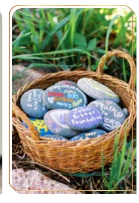
PURPOSE To prevent unnecessary suffering because of the unknown.