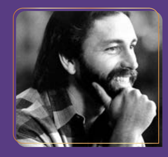
TWENTY YEARS OF HONORING JOHN'S LEGACY